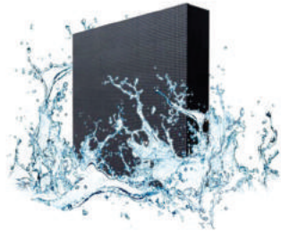
IP65 Protection Level